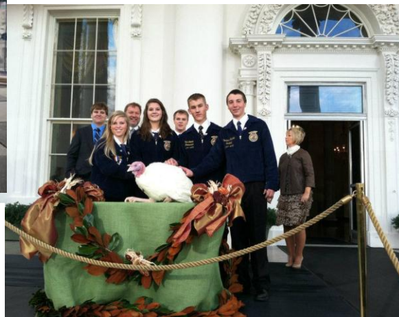
Willmar FFA members pose outside of White House with the Presidential pardoned turkey.